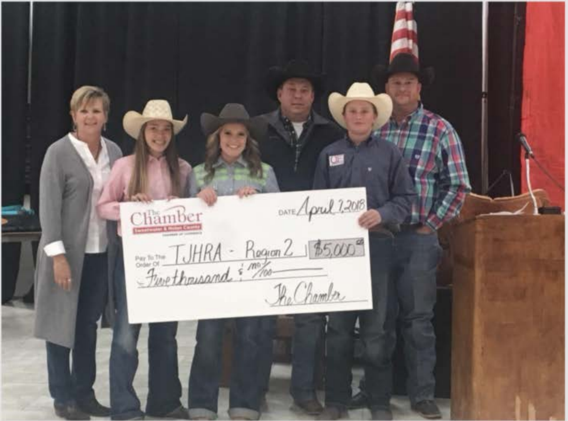
The Chamber, Sweetwater & Nolan County donated $5000.00 to the Texas Junior High Rodeo Association-Region 2 in April.