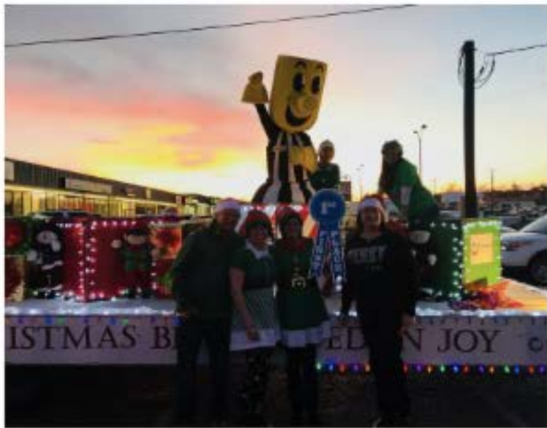
Overall Float First Place- Taylor Electric Coop