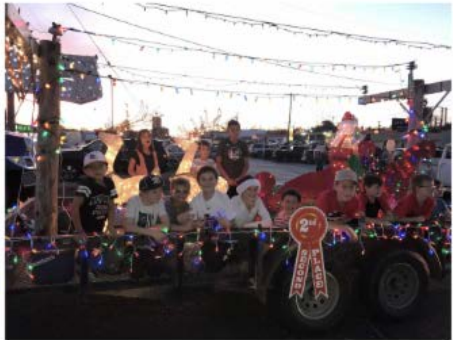
Overall Float Second Place- Big Country Electric Coop.