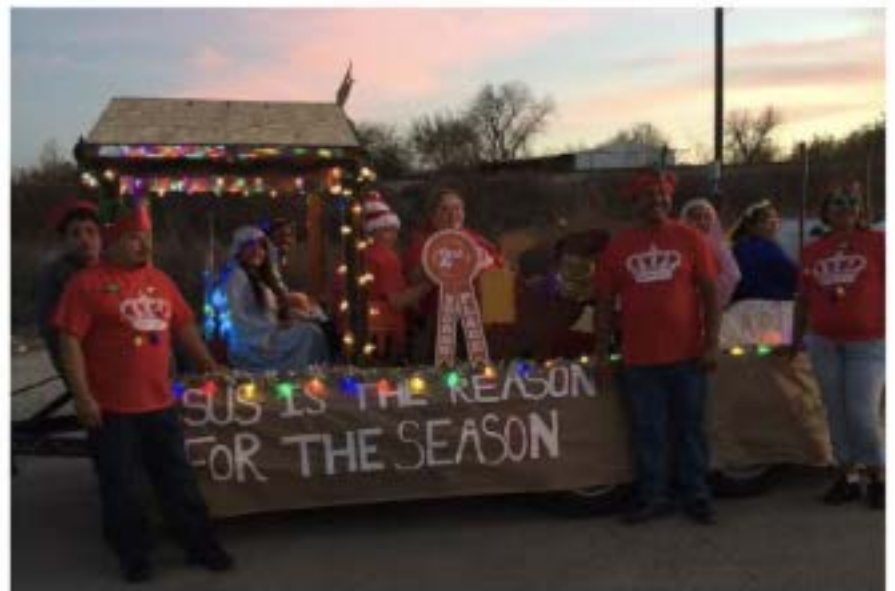
Children's Float Second Place- Iglesia De La Fuente Carmesi